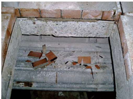
Figure 4. Electrical Conduit under Concrete Cut

Building 360 is supported by concrete piers. The top of the piers (the widest part of the concrete cone) are approximately 4 feet wide and are, for the most part, 12 feet center-to-center (see Figure 3). This presented a challenge to place the electrodes on 15-foot centers in preferred locations.