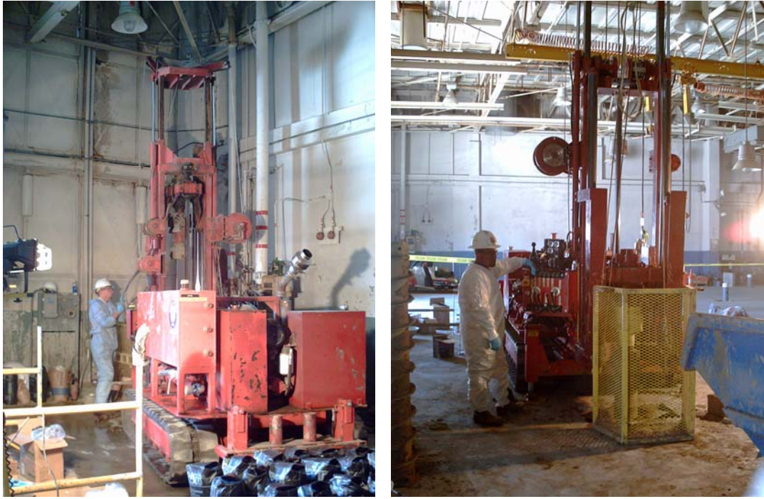
Figure 5. Drilling inside Building 360, Alameda Naval Base, CA