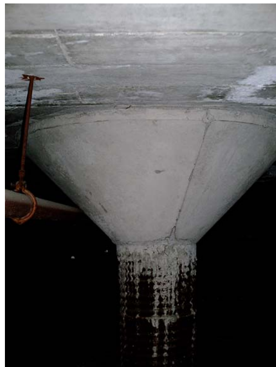
Figure 3. Concrete Pier Supports under Building 360

We cut 18" x 18" squares in the building floor over our electrode locations. Sometimes, when removing the cuts, we encountered surprises such as the electrical conduit seen in Figure 4.